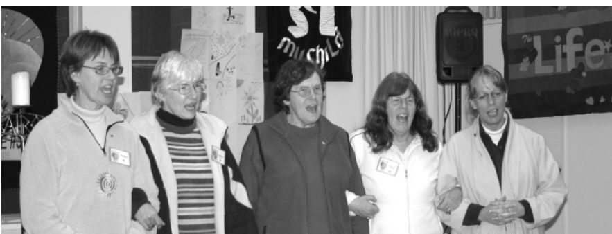
The leaders of Kairos Outside singing to guests

The ministry is growing slowly in South Australia. We have had 22 guests since it started eighteen months ago. We meet bimonthly and have between 20 and 40 people attending reunions. We now have four small groups established. SWAP groups where women meet to S hare their journey with God, W itness to God's work in their lives, are A ccountable to each other and P ray for each other. We are currently preparing for KO #4 in December.